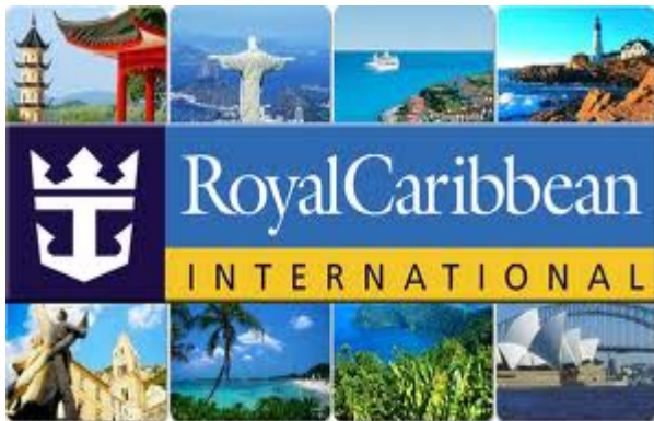
ทัวร์เรือสำราญ รอยัล แคริบเบียน ล่องอลาสก้า