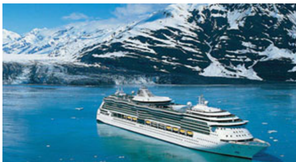
ทัวร์เรือสำราญ รอยัล แคริบเบียน ล่องอลาสก้า

May 24 Jun 07 , 21 Jul 05 , 19 Aug 02 , 16 , 30