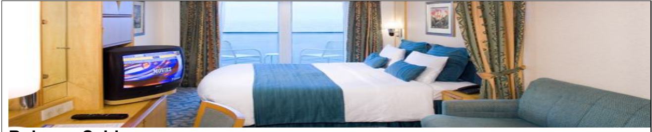
Balcony Cabin Open your private balcony and take in the beautiful view. It's a great way to get close to every destination and make the most of your vacation at sea.