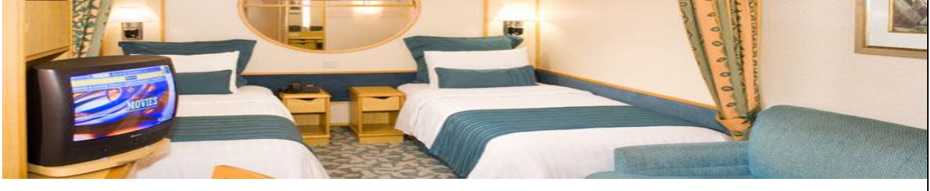
Inside Relax in all the comfort of our interior staterooms. These nicely appointed rooms are an excellent value.